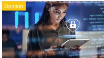
Cybersecurity 5 dec 2023